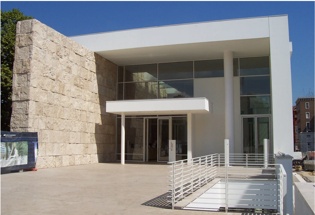
Fig. 1 – The use of split stone contrasting with the purity of plastered forms, Ara Pacis Museum , Richard Meier, 2006, Roma.

physical well-being. Additionally, the materiality of buildings can contribute to the creation of distinctive atmospheres and the expression of aesthetic and cultural values.