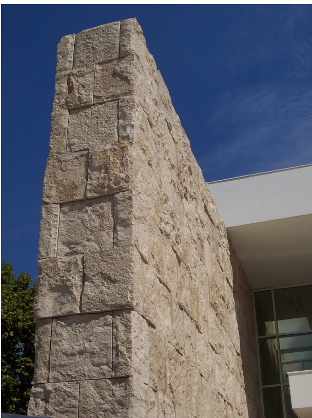
Fig. 3 – Detail of the wall constructed with split stone, Ara Pacis Museum , Richard Meier, 2006, Roma.