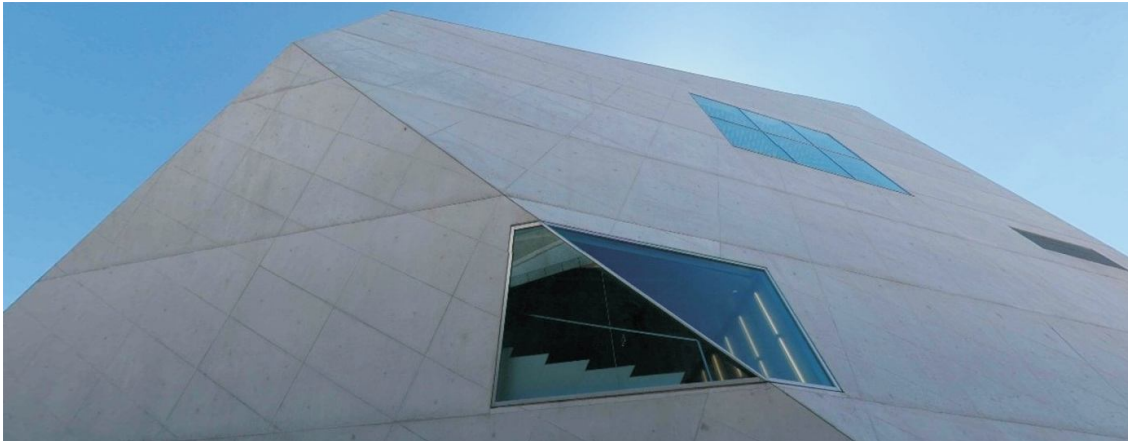
Fig. 9 – The exterior cladding white cement panels, Casa da Musica , Rem Koolhaas, 2005, Porto.