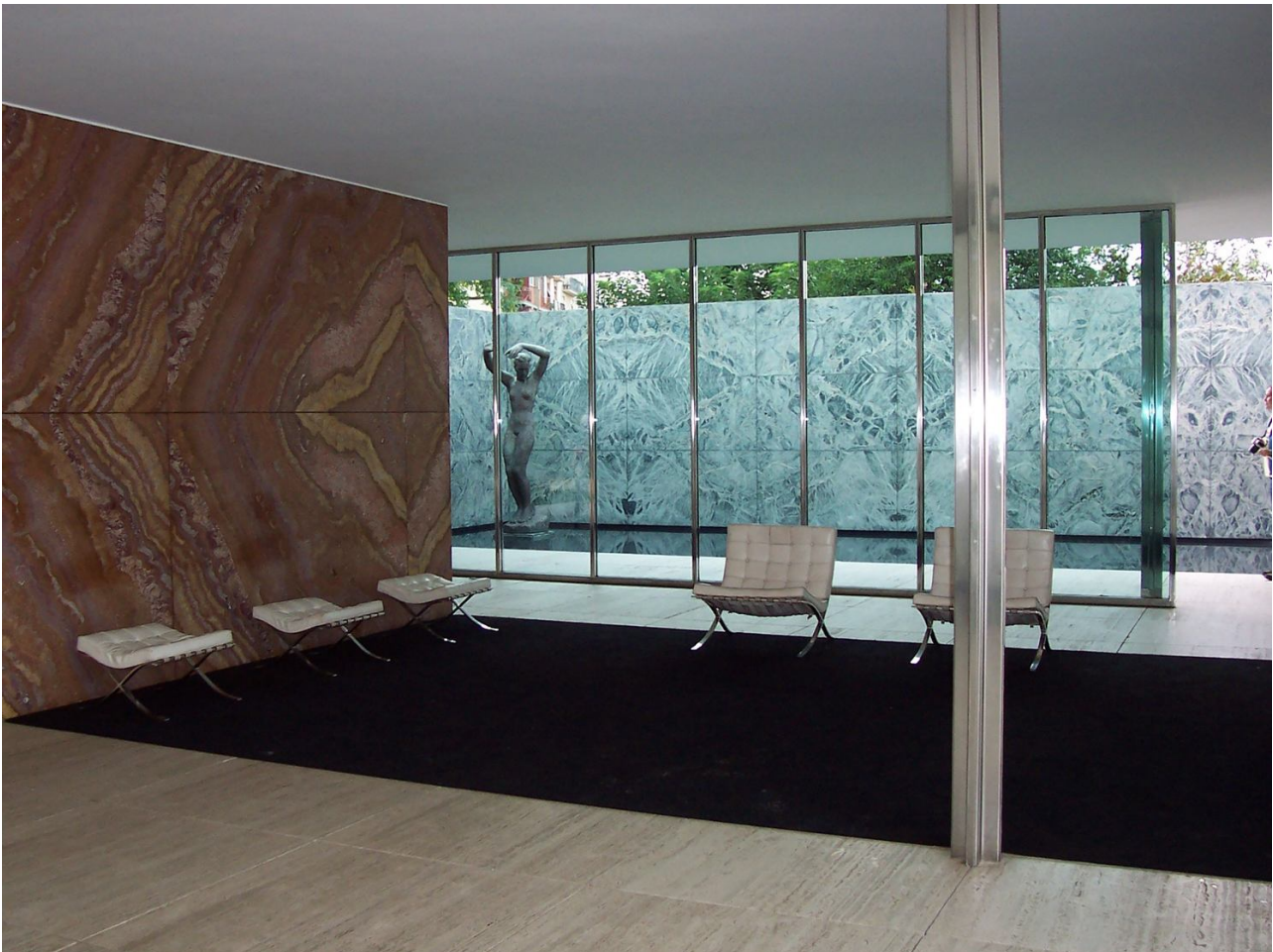
Fig. 4 – The use of open-patterned stone decorating the space, Barcelona Pavillon , Mies van der Rohe, 1929, Barcelona.

The term “phenomenon” derives from the ancient Greek “phainomenon”, which means “that which appears” or more precisely “that which is visible”. In a general sense, a phenomenon can be defined as an observable event or manifestation that occurs in the natural world or in other domains.