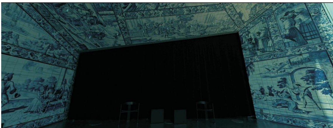
Fig. 11 – The interior cladding with traditional tiles “azulejos”, Casa da Musica , Rem Koolhaas, 2005, Porto.