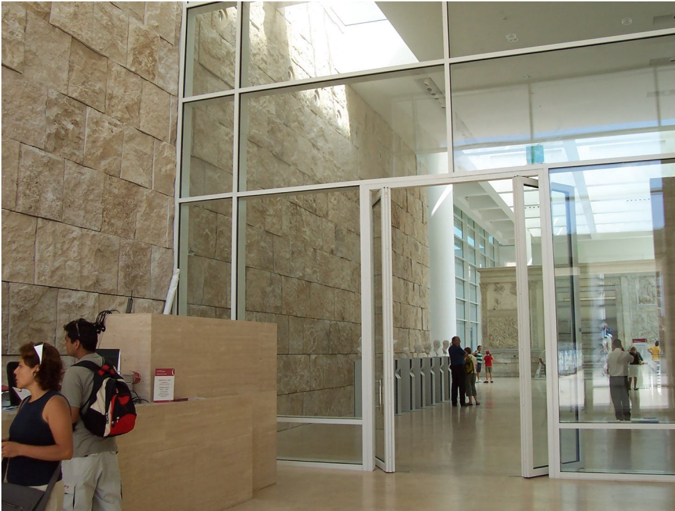
Fig. 2 – The use of split stone juxtaposed with the purity of plastered forms and the white marble or the Ara Pacis, Ara Pacis Museum , Richard Meier, 2006, Roma.