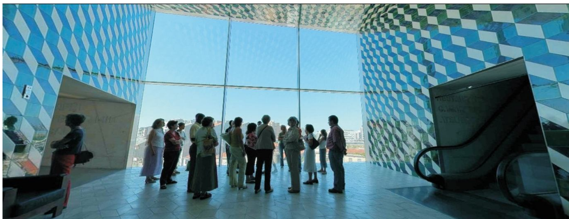
Fig. 10 – The interior cladding with tiles featuring geometric patterns, Casa da Musica , Rem Koolhaas, 2005, Porto.