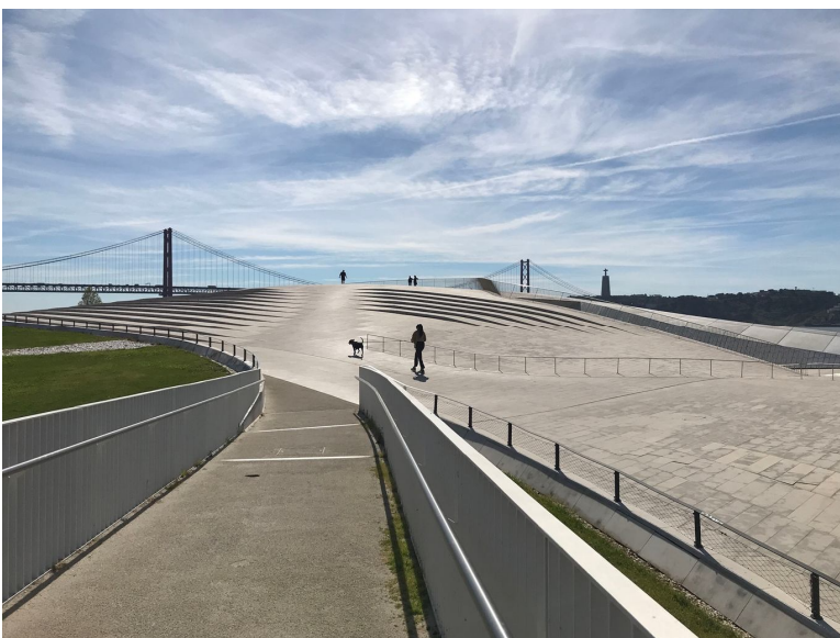
Fig. 6 – The use of local stone that becomes landscape, MAAT , Amanda Levante, 2016, Lisbon.

The value of an urban context can derive from various factors, including the preservation of historical and cultural heritage, the promotion of diversity, and the creation of attractive and accessible public spaces. The historical tradition of a place contributes significantly to its identity and value. Architectural elements, structures, materials, and decorative details that reflect the history and culture of a place imbue architectural spaces with depth and a unique character. These elements can be witnesses to past epochs, significant events, or local traditions and can contribute to creating a sense of continuity and belonging.